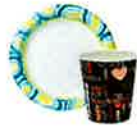
Paper Cups, Plates (Trash)